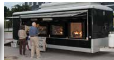
Stop by for a fireside chat at the Empire Trailer.