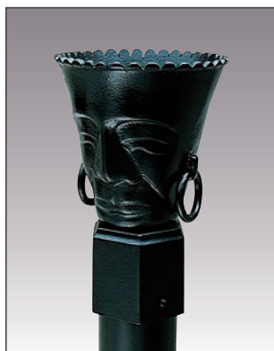
THE POLYNESIAN PT2-N/PT2-P

Shown mounted on an aluminum post (#POBA)