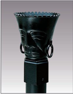
THE POLYNESIAN PT2-N/PT2-P 9" H x 16" W 14,000 BTUs