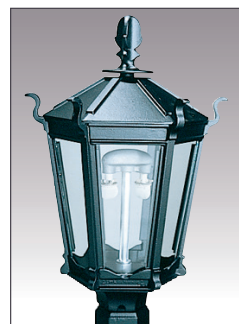
WK5A Series 23" H x 14" W