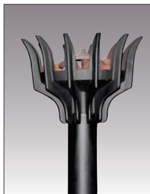
THE LIBERTY LT-N/LT-P