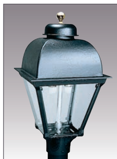
HJ3A Series 22" H x 10-3/4" W