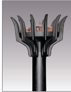
THE LIBERTY LT-N/LT-P 13" H x 9" W 45,000 BTUs