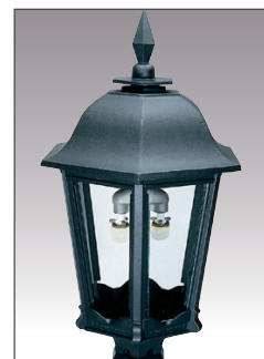
VK7A Series 24" H x 13-1/2" W

All lamp heads are available in natural or propane gas and are available with the Standard Dual Inverted Burner, Optional Upright Burner or Optional Open Flame Burner.