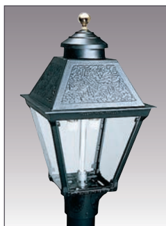
HK1A Series 22" H x 10-3/4" W