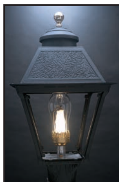
Upright Burner Optional