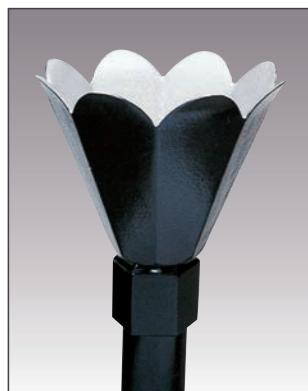
THE FLOWER FT2-N/FT2-P