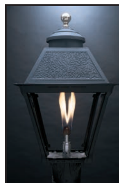
Open Flame Burner Optional