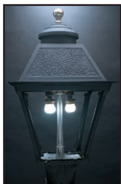
Dual Inverted Burner Standard

Everglow Gas Lamps are available with three burner options—dual inverted, upright or open flame—allowing you to create the dramatic effect you want for your outdoor space. Available in LP or Natural Gas.