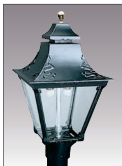
GG2A Series 22" H x 10-3/4" W