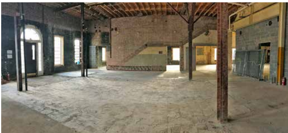
Renovations are expected to be completed in late 2020

In addition to office space, the newly renovated building will feature a state-of-the-art appliance showroom featuring a semi-circular gas log display, modern linear fireplaces, tankless water heating wall, outdoor living area and more. From standard natural gas appliances to emerging technologies, the new showroom will be a center for sales and education.