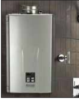
TANKLESS WATER HEATERS