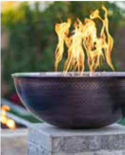
OUTDOOR FIRE FEATURES