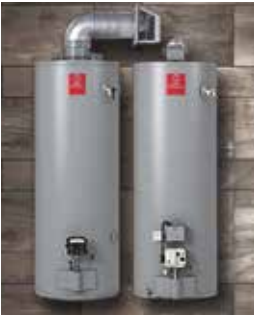
TANK WATER HEATERS