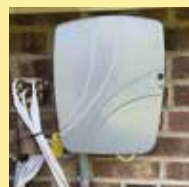
TELEPHONE/ CABLE TV WIRING