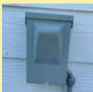
DISCONNECT FOR HVAC