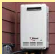
EXTERNAL TANKLESS WATER HEATER